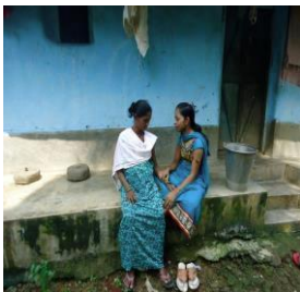
Orientation to PW by ANM