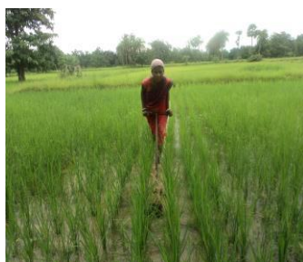
Weeding by growers in SRI Field Agriculture

Her regular presence in PUSPAC activities like workshop on crop planing ,preparation of all organic menure, soil testing, plant tretment and seeds treatment training. Sub producer group meeting her a potential vegetable grower through SHG interaction, she now he sends children to school regularly. She was very happy to her that PUSPAC, through Madhyam Foundation. Handhoe, weight measure and PUSPAC staffs for benefit of the vegetable growers .