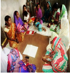
Mamata schemes linkages