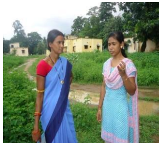
Orientation to ASHA by LHA