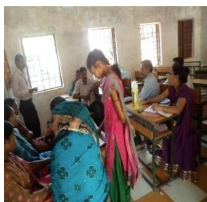
Steering committee meeting at Salimi