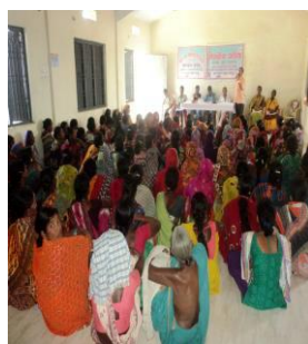
Social Audit at Padmagiri