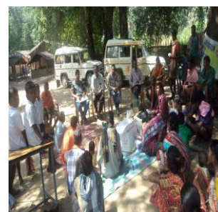
Monitoring visit by CHC,