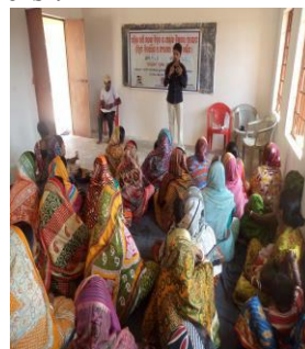
Crop planning training