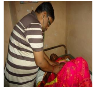
PW Checked by Doctor