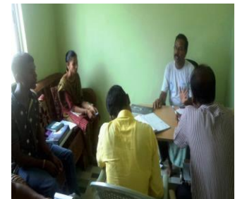
Arogya Plus, Salimi