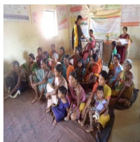
ANC check up by ANM