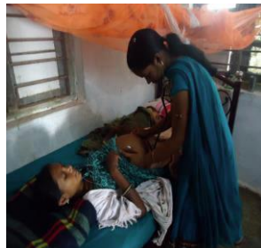
PW Checked by ANM