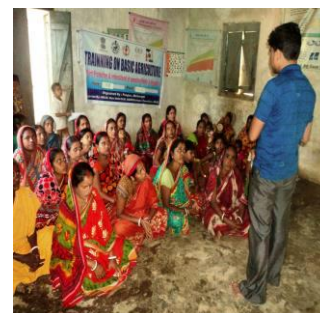
Training on Basic